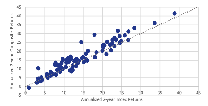
Concentrated Value (Net) & Russell 3000 Value Index Rolling Returns

Your team at Nuance cautions clients regarding the use of short-term performance as a tool to make investment decisions. That said, if a client wants to consider our short-term performance, we recommend emphasizing two-year rolling periods since our inception. Our normal discussion of short-term performance will center on two-year performance, but we will also note calendar year to date results as is our tradition.