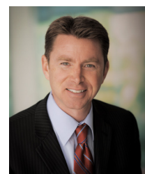
President and Chief Investment Officer