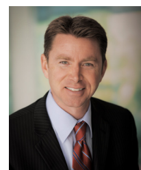
President and Chief Investment Officer